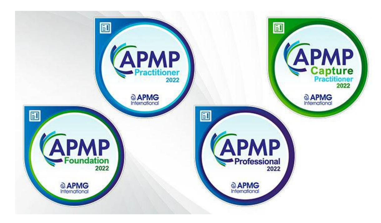
Figure 1: The Certifications levels of APMP are Foundation, Practitioner, Capture Practitioner, and Professional.

As an Approved Training Organization (ATO) BidBox supports acquisition of APMP Certificates by offering APMP specific training, boot-camps, and preparation for and organization of examinations.