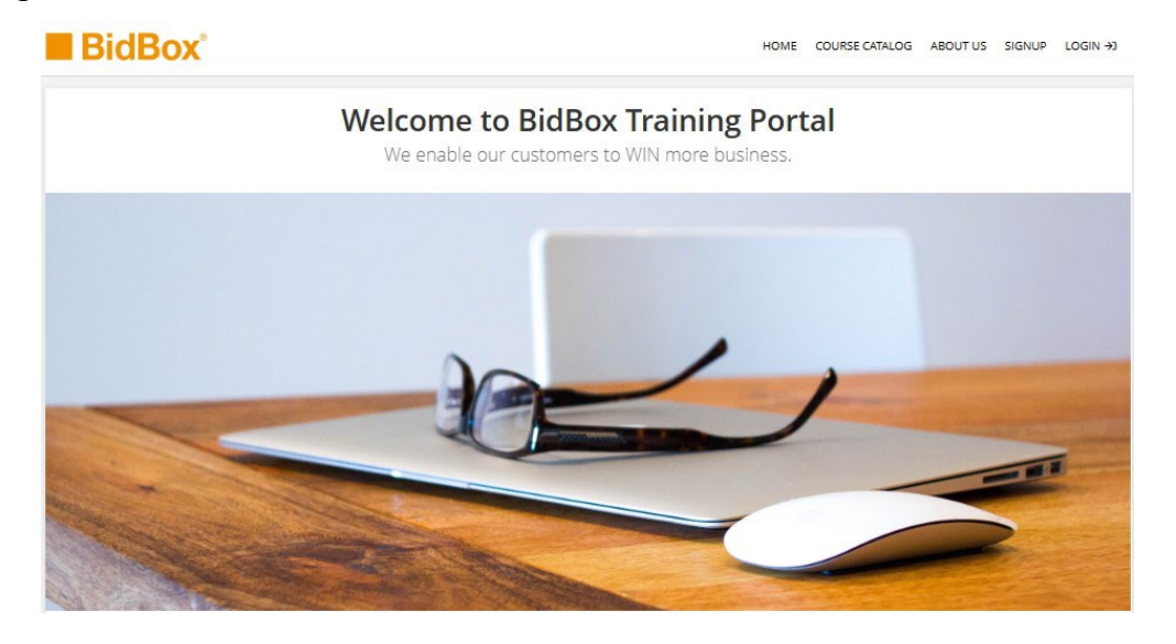
Figure 4: BidBox Trainings, Workshops and APMP Certifications Material and Courses are available Online at the BidBox Learning Management System.

For the training we also use our BidBox LMS system, where you find the content for your trainings, test exams, self-paced learning modules, your certificates and a summary of the training.